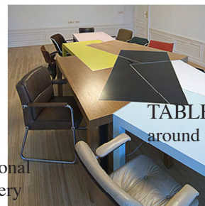
TABLE ACCIDENT. everybody around the table is diffrent.

They combined concepts into their design.