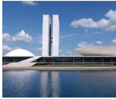
Le corbusier: THE BRASILIA PROJECT