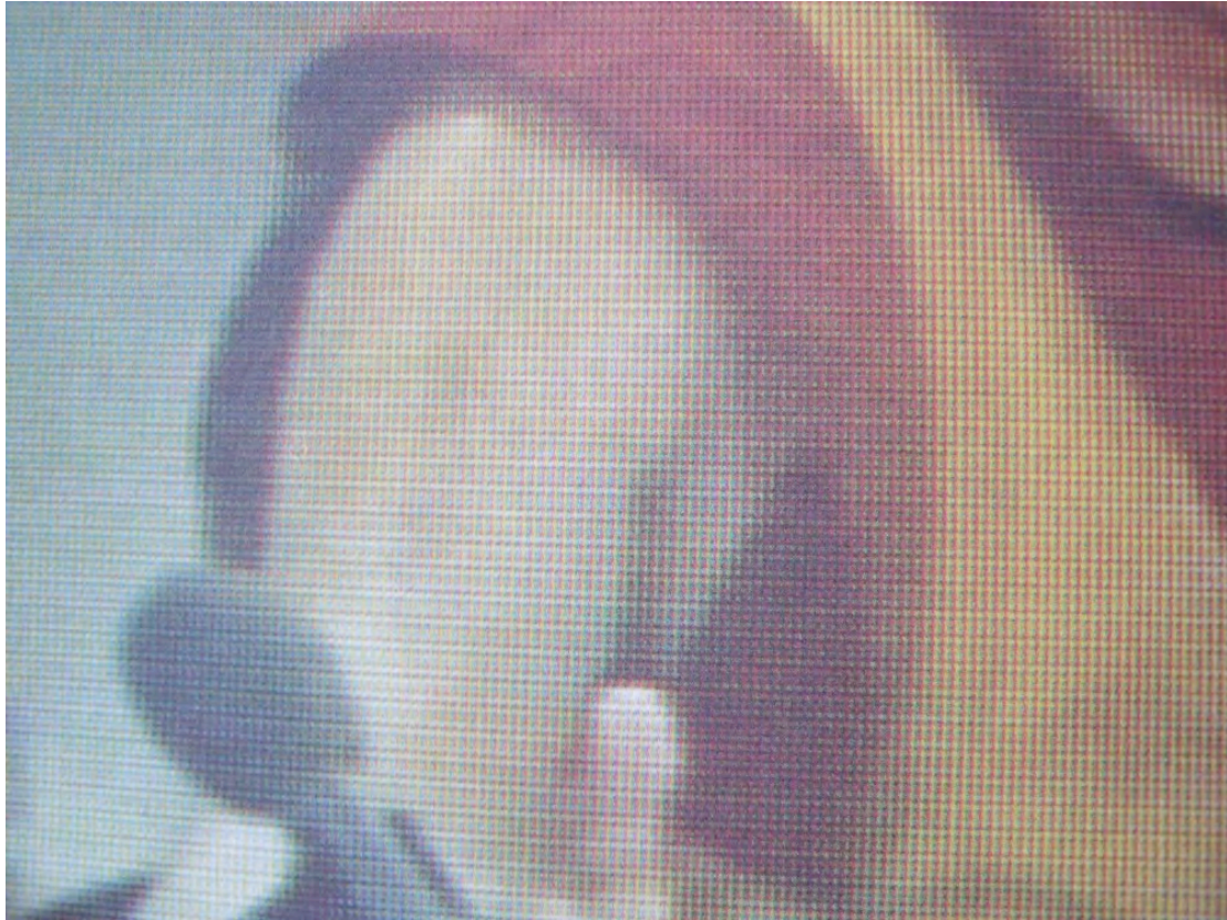
Verge paper Printing effect, close up.

The photo's from the archive in the book are printed like they were on verge paper, a type of paper that was used in the 18th century.